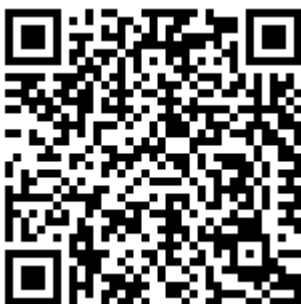
SCAN QR FOR PRODUCT PAGE

*For binder units 13-24 the second binder unit is clear